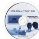
CD-Rom with Manual/Data