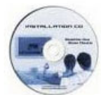
CD-Rom with Manual/Data