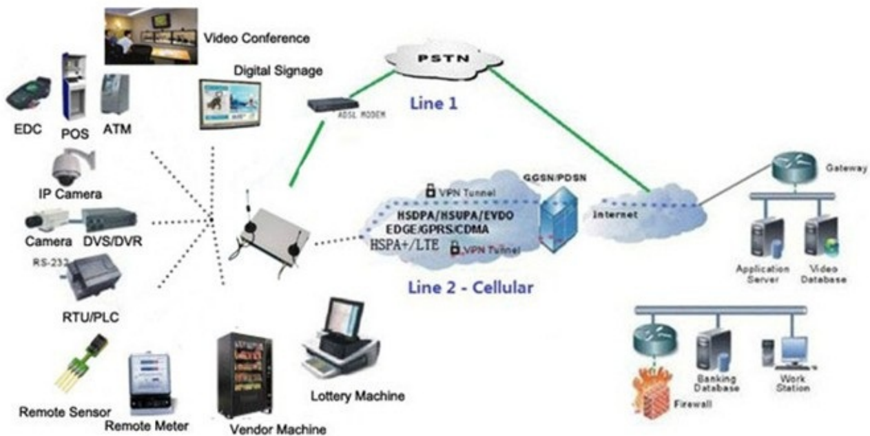
Single H820 Typical Application Diagram