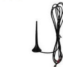
Rubber Magnetic-Mount W/ Cable