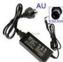
AU Power Supplier