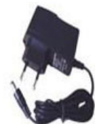
EU Power Supplier