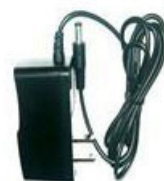
US Power Supplier