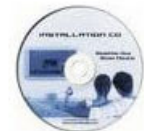
CD-Rom with Manual/Data