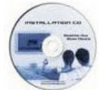
CD-Rom with Manual/Data