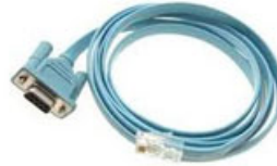
RJ45 to DB9 Cable