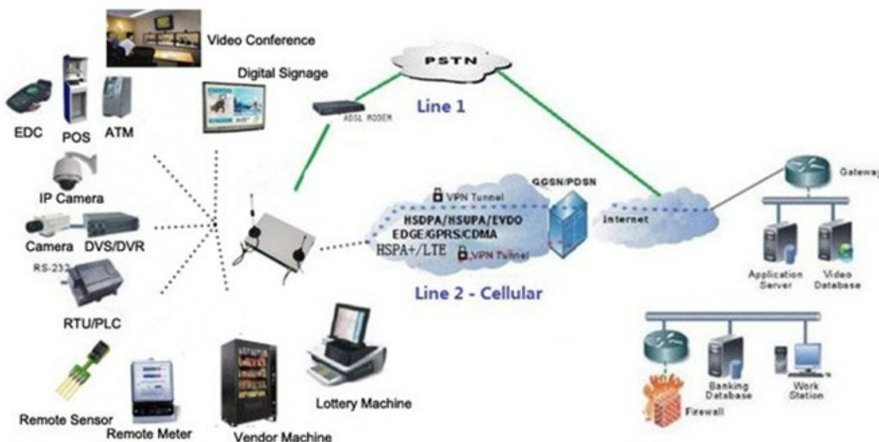
Single H820 Typical Application Diagram