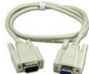
DB9 serial cable