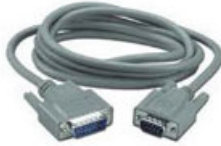
DB15 to DB9 Cable