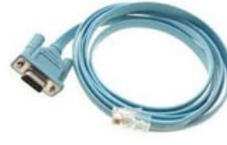
RJ45 to DB9 Cable