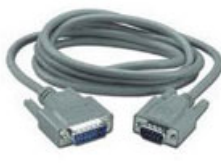
DB15 to DB9 Cable