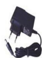
EU Power Supplier