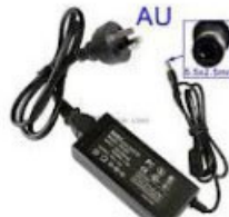
AU Power Supplier