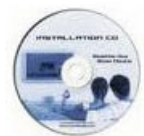
CD-Rom with Manual/Data