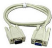
DB9 serial cable