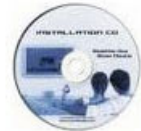
CD-Rom with Manual/Data