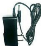
US Power Supplier