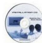
CD-Rom with Manual/Data