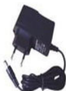
EU Power Supplier