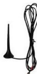
Rubber Magnetic-Mount W/ Cable