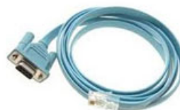
RJ45 to DB9 Cable