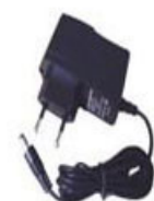
EU Power Supplier