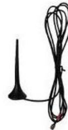
Rubber Magnetic-Mount W/ Cable