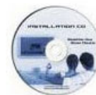
CD-Rom with Manual/Data