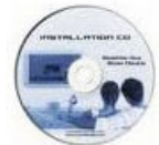
CD-Rom with Manual/Data