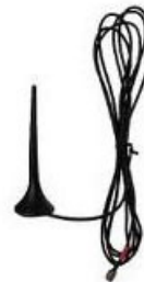
Rubber Magnetic-Mount W/ Cable