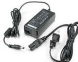
Desktop Power Supplier EU, US, AU, UK for choice