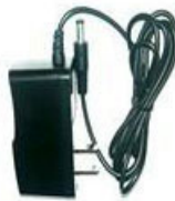
US Power Supplier