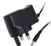
UK Power Supplier