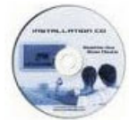
CD-Rom with Manual/Data