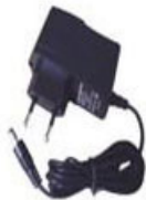
EU Power Supplier