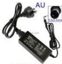
AU Power Supplier