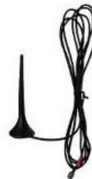
Rubber Magnetic-Mount W/ Cable