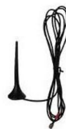
Rubber Magnetic-Mount W/ Cable