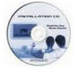
CD-Rom with Manual/Data