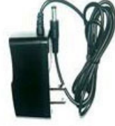
US Power Supplier