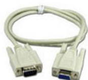
DB9 serial cable