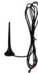
Rubber Mangetic-Mount W/ Cable