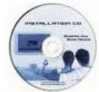
CD-Rom with Manual/Data