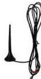
Rubber Magnetic-Mount W/ Cable