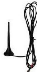
Rubber Magnetic-Mount W/ Cable