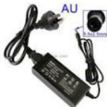
AU Power Supplier