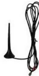
Rubber Mangetic-Mount W/ Cable