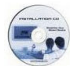
CD-Rom with Manual/Data