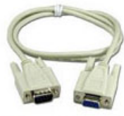
DB9 serial cable