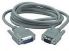
DB15 to DB9 Cable