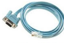
RJ45 to DB9 Cable