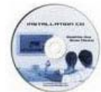
CD-Rom with Manual/Data