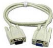
DB9 serial cable