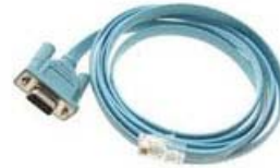
RJ45 to DB9 Cable