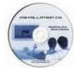
CD-Rom with Manual/Data