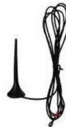
Rubber Magnetic-Mount W/ Cable