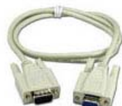
DB9 serial cable