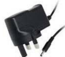
UK Power Supplier