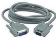
DB15 to DB9 Cable