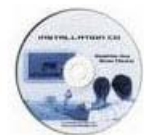
CD-Rom with Manual/Data