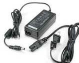
Desktop Power Supplier EU, US, AU, UK for choice