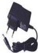
EU Power Supplier