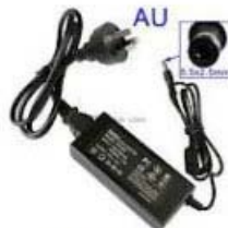
AU Power Supplier